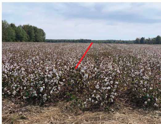
Grower Standard Dry Fertilizer

ALWAYS READ AND FOLLOW LABEL DIRECTIONS.